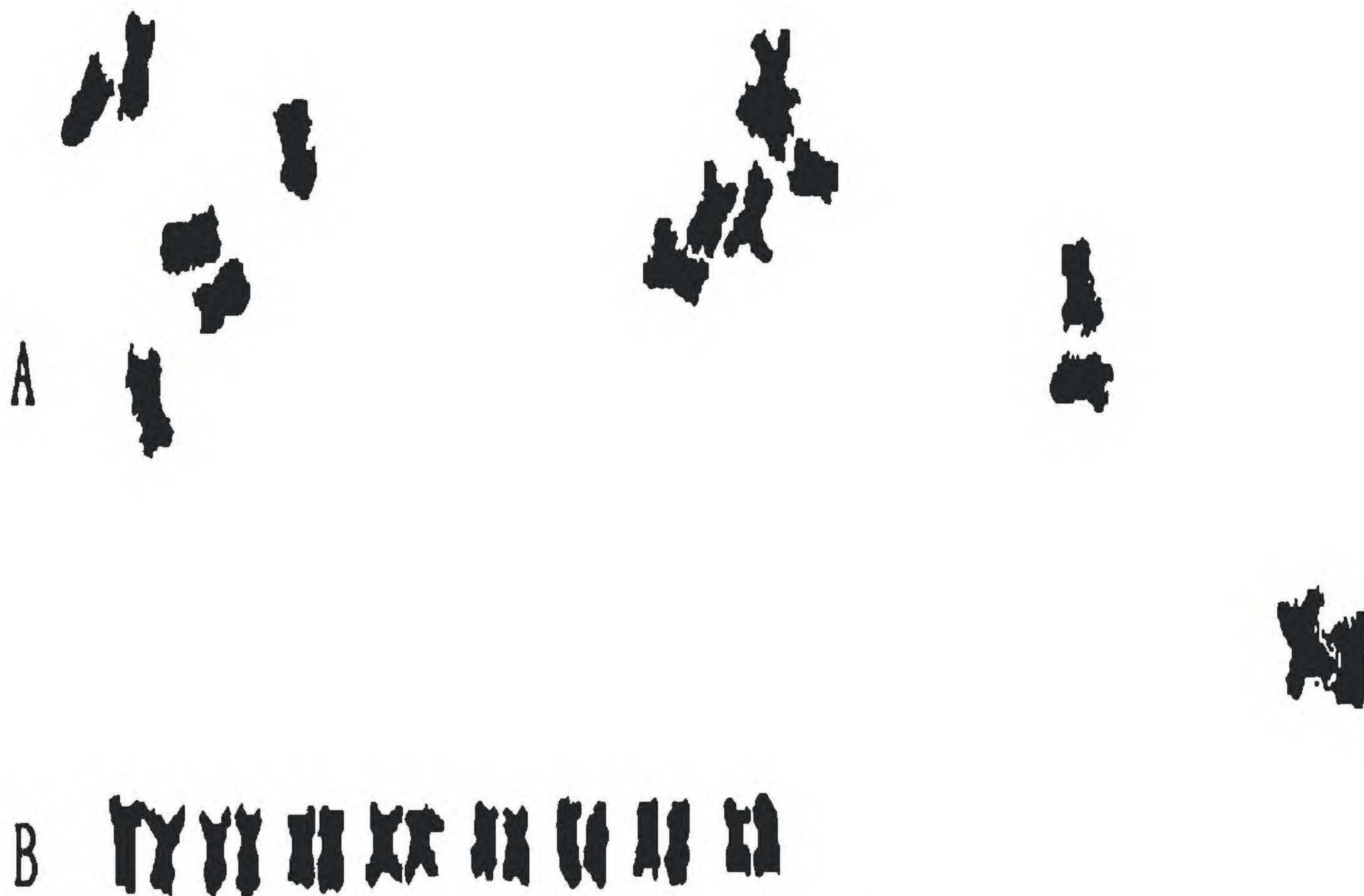
Figure 2. Fagopyrum pugense T. Yu. —A. Root tip cell chromosomes. —B. Idiograms.

IUCN Red List category. Fagopyrum pugense is assessed here as Least Concern (LC) according to IUCN Red List criteria (IUCN, 2001) because of its relatively extensive distribution and because the areas in which it has been collected are part of a protected habitat.